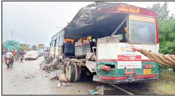
The ill fated UP Transport Corporation bus which was badly damaged in an accident near Nanke Chak, Samba on Wednesday.