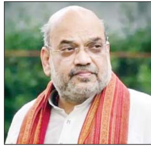
Union Home Minister Amit Shah

Excelsior Correspondent JAMMU, Nov 9: Union Home Minister Amit Shah today said the country is fighting terrorism as well as its support system together and a victory is possible only through a decisive fight against both of them. Chairing a high-level meeting of the Intelligence Bureau (IB) officials from across the country in New Delhi, Shah also said there is a need to control Left Wing Extremism by dismantling the financial and logistical support system. The Home Minister said the country's fight is against terrorism as well as its support system and unless it fights strictly against both of them, victory over terrorism cannot be discussions on various issues related to national security, including counter terrorism, threats from extremism, cyber security related issues, border related aspects and threats from cross-border elements to the integrity and stability of the nation. According to the statement, the Home Minister said the achieved, an official statement said. Shah stressed on the need to "strengthen the process of information sharing and enhancing liaison between counter-terrorism and anti-drug agencies" of the States. Shah also reviewed the internal security situation in the country. The meeting held extensive