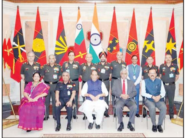
Defence Minister Rajnath Singh with Army Commanders and others at a conference in New Delhi on Wednesday.

ing on 'Transformational imperatives for a future ready force'. The Army said the Defence Minister commended the force