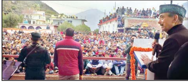
Former J&K Chief Minister and DAP Chairman Ghulam Nabi Azad addressing large rally at Khellani in Doda on Wednesday.