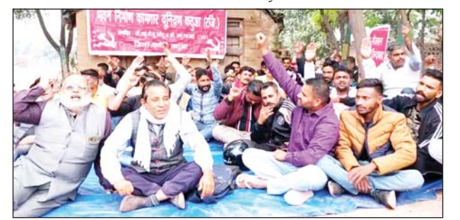
Members of BNKU and unemployed youth staging protest at Barnoti, Kathua.

It worked as an ideal interactive platform between the Farm Producers and the Agro Industry, creating linkages for value creation and value addition. The event was inaugurated in the presence of Jagdeep Dhankar, Vice President of India. It saw participation of hundreds of exhibitors from across the world, with display of state-of-the-art equipment & Technology, innovation and best practices, providing a deeper insight into Indian Agri industries and shaping the way of its growth. The event has provided an excellent platform to the budding and established entrepreneurs of J&K in terms of improved product visibility, high on spot sale, opportunity for synergetic collaborations, market and competitor knowledge, insights into best practices of business and use of technology in business development.