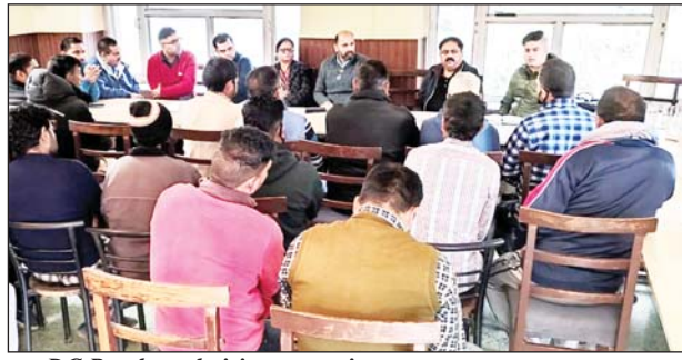
DC Ramban chairing a meeting.