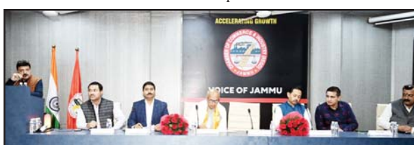
CCI team during meeting with JMC Mayor and Dy Mayor at Jammu on Thursday.

He said that police are ascertaining the details, however, preliminary investigation suggests asphyxiation as the cause of death.