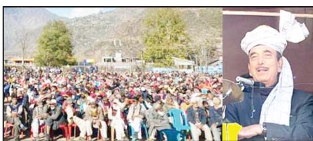
DAP leader Ghulam Nabi Azad addressing a rally at Uri on Saturday.

"Those who followed the wrong path, be it drugs or guns,