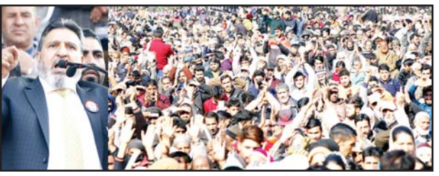
Apni Party president Altaf Bukhari addressing a mega rally in Srinagar on Saturday.

"The huge purpose of organising this huge public gathering is to urge Gol to restore the Statehood to Jammu and Kashmir and hold Assembly elections without any further delay. On this occasion, we want to remind the Government that it