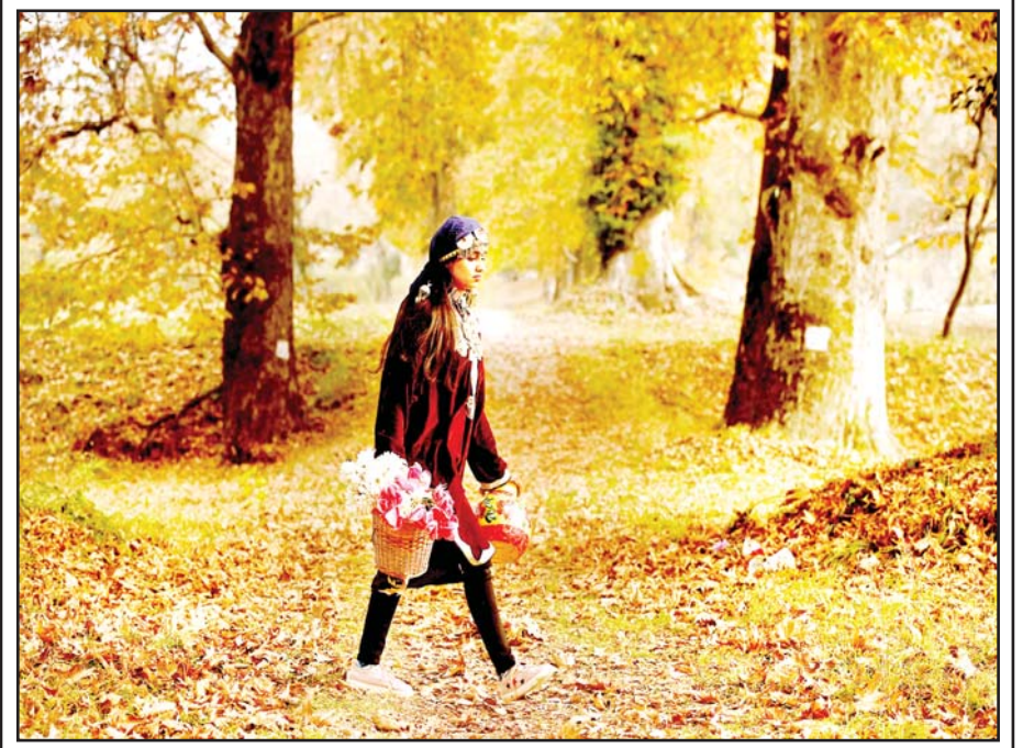
Tourist walks on Chinar leaves during the autumn season in Nishat Garden in Srinagar.