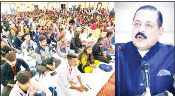
Union Minister Dr Jitendra Singh addressing an event organised by ABVP at Jammu on Saturday.

Addressing an event of BJP's student wing ABVP here today, Dr Jitendra Singh regretted that for over seven decades the youth of India have suffered to get