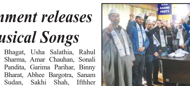
AAP leaders posing with new entrants of the party during a function in Srinagar.

SRINAGAR, Nov 12: Kashmir province Incharge of Aam Aadmi Party (AAP)