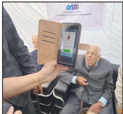
A 95 year old pensioner getting his life certificate for pension during a camp at Jammu on Saturday.

JAMMU, Nov 12: The Department of Pension & Pensioners' Welfare, Ministry of Personnel, Public