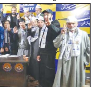
AAP leaders posing with new entrants of the party during a function in Srinagar.

SRINAGAR, Nov 12: Kashmir province Incharge of Aam Aadmi Party (AAP)