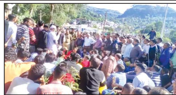
Relatives of vegetable vendor staging protest against police in Kalakote area of Rajouri.