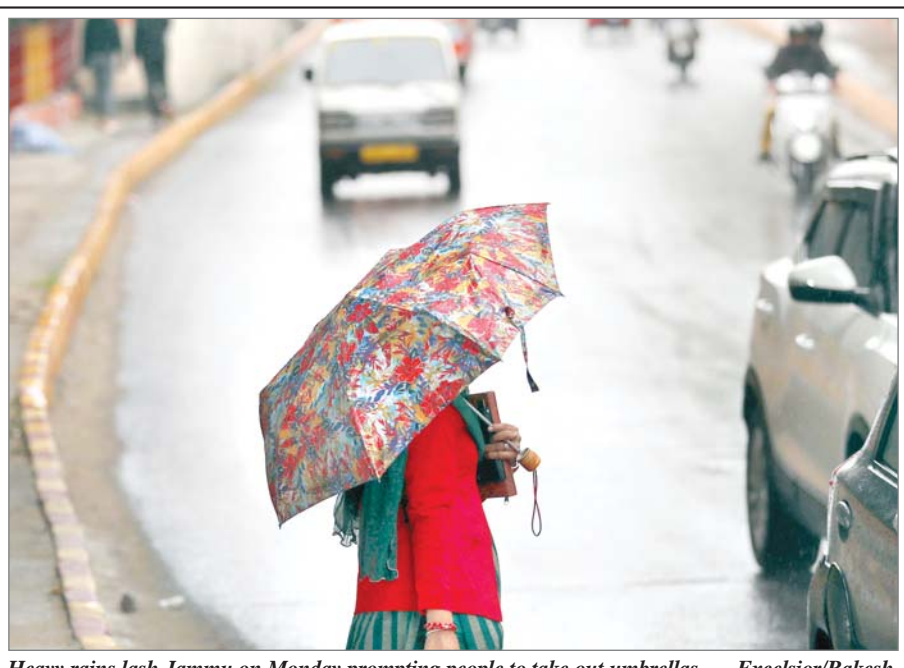
Heavy rains lash Jammu on Monday prompting people to take out umbrellas.