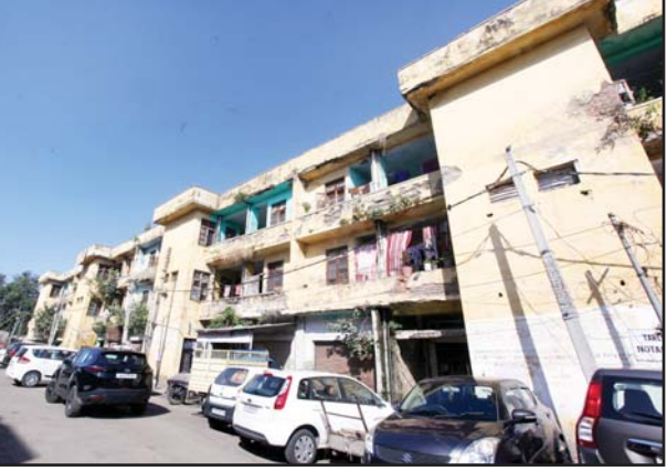
Old unsafe Ware House buildings to be dismantled by JDA in Jammu shortly.

identified and a final decision in this regard was yet awaited. Besides shops, about 132 families residing in the Government quar-