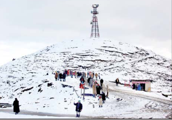
Tourists enjoying at Natha Top after season's first snowfall on Monday. Another pic on page 4.

region including Natha Top, Pir Panjal, Seoj Dhar, Pir Ki Gali on