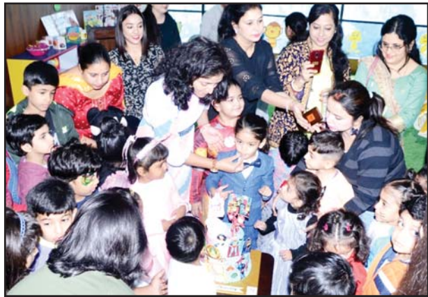
Teachers and students during Children's Day celebrations.