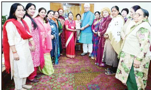
Delegation of WWAO calling on Lt Governor Manoj Sinha in Jammu.