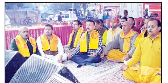
Pujaris chanting Vedic Mantras at the shrine of Baba Jitto on concluding day of Jhiri Mela on Wednesday.

"Any observation made or finding recorded shall not form any basis for deciding the inter se merit of the parties in OA/interim application. The Tribunal shall ensure that appropriate orders are passed on the next date, so as to avoid any delay in the proceedings", DB added.