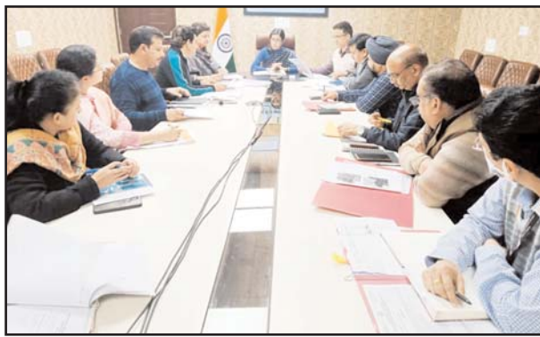
DC Jammu chairing a meeting.