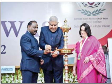
Vice President, Jagdeep Dhankar inaugurating 2nd Audit Diwas at the Office of the Comptroller & Auditor General of India (CAG) in New Delhi on Wednesday.