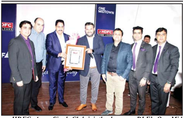
HDFC, Amar Singh Club jointly showcase DLF's One Midtown Delhi project in Jammu.