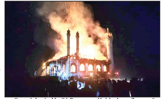
Central Jamia Masjid Drass engulfed by huge flames after accidental fire incident on Wednesday evening.