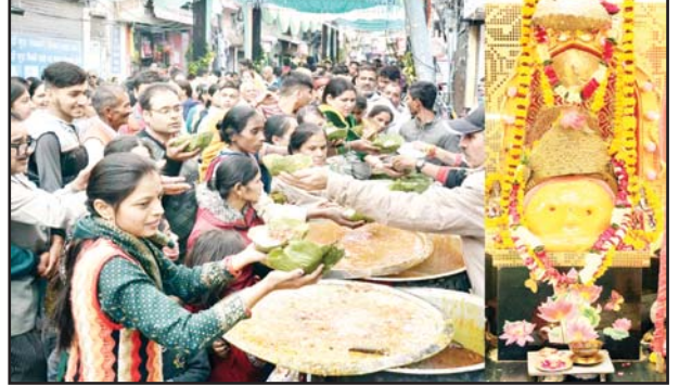
Devotees being served food at a Bhandara in Bhairav Mandir, Jammu.