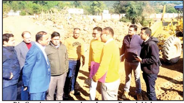
Div Com inspecting work on Jammu-Poonch highway.

He reviewed the status of writing of Jamabandis, change