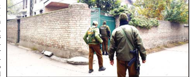
Cops during searches in Srinagar on Saturday.