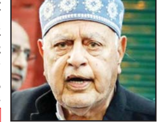
Farooq Abdullah today made it clear that he would be contesting the next Assembly polls in Jammu and Kashmir.

Pertinent to mention that Farooq Abdullah has not con-