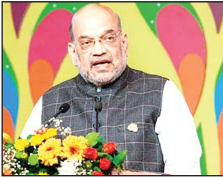
Union Home Minister Amit Shah speaks during the third 'No Money for Terror' Ministerial Conference in New Delhi on Saturday.

In his concluding remarks at closing session of 3rd 'No Money for Terror' conference in New Delhi today, Shah said no country or organization can successfully combat terrorism alone. "The international com-