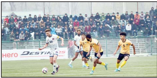
Real Kashmir Football Club players and Rajasthan FC players in action during Hero I-League match in Srinagar.