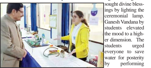
A student demonstrating scientific model to a dignitary at Rich Harvest School on Saturday.

Excelsior Correspondent JAMMU, Nov 19: Rich Harvest School (RHS) hosted 'SCIFARI-2022' under the banner of Sahodaya Schools Complex wherein budding scientists from 25 CBSE schools par-