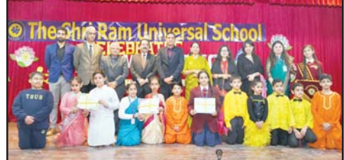
Students and management posing for a group photograph with dignitaries during celebration of Founder's Day at TSRUS Jammu on Saturday.