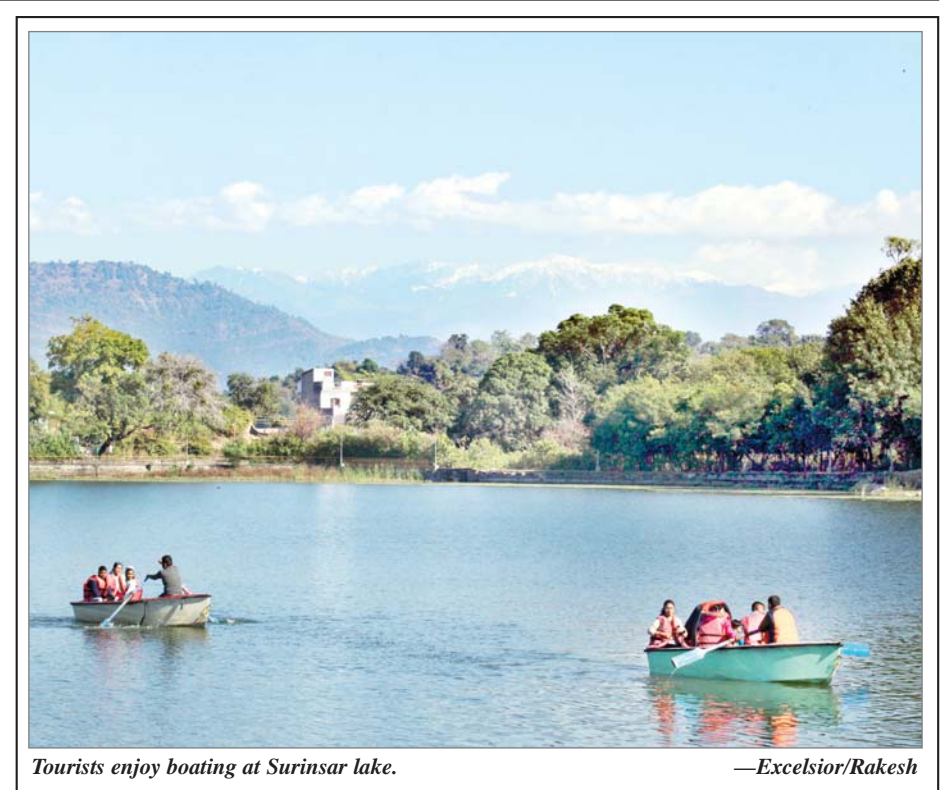
Tourists enjoy boating at Surinsar lake.