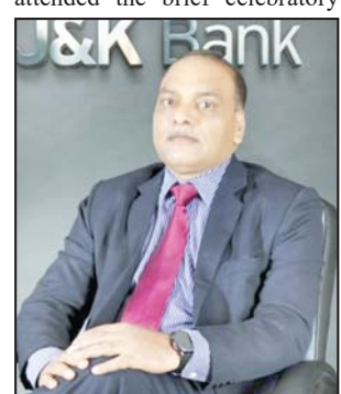
function through video-conferencing on the occasion.

for their valued guidance and above all Bank's valuable customers and clients for their unflinching trust and loyalty. All the Bank's Vertical Heads, Divisional Heads, GMs, DGMS, Zonal Heads, Cluster Heads attended the brief celebratory