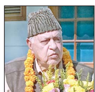
Farooq said at the sidelines of a joining function here.

"I am tired of advocating dialogue with Pakistan that is dubbed as 'anti-national'. I'm happy that we (India) are assuming the presidency of G-20 next month and I hope that Prime Minister Narendra Modi will be successful in ending the Russia-Ukraine war that had badly hit the economy of the world,"