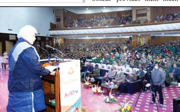
LG Manoj Sinha addressing Annual Youth Festival at University of Kashmir on Wednesday.

increase in their retirement age is immediate solution. However, he said, the selection process of faculty will go on.