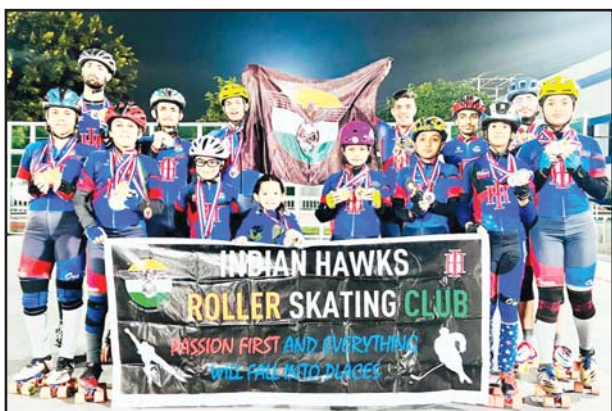
Skaters displaying medals while posing for a group photograph at MA Stadium Jammu.

The SSP congratulated the winning team for showcasing excellent performance in the final match and interacted with the players and also assured them that Ganderbal Police is always at their door steps for every assistance. Locals also witnessed the grand finale event and expressed gratitude towards Police and appreciated their role to channelize the energy of the youth of the district towards sports and other constructive activities.