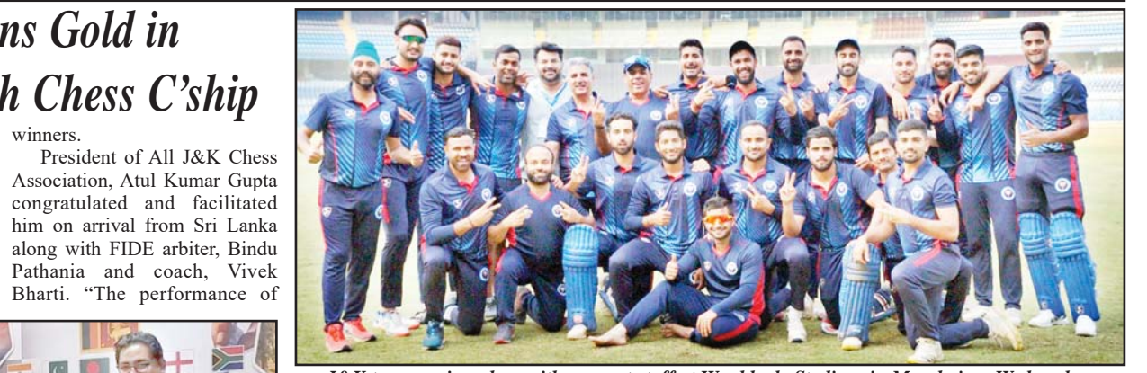
JK's Sr team posing alongwith support staff at Wankhede Stadium in Mumbai on Wednesday.