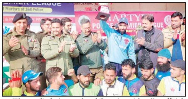
Winners displaying trophy while posing with police officials at Ganderbal on Wednesday.