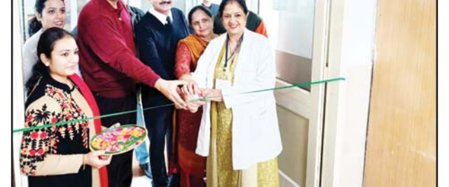
Blood donation camp being inaugurated in GMC Jammu on Wednesday.