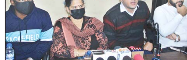
Employees of Private Nursing Colleges addressing a press conference at Jammu on Thursday.