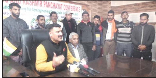
AJKPC president, flanked by others addressing press conference in Jammu on Thursday.

The search operation was going on at the time of filing this report.