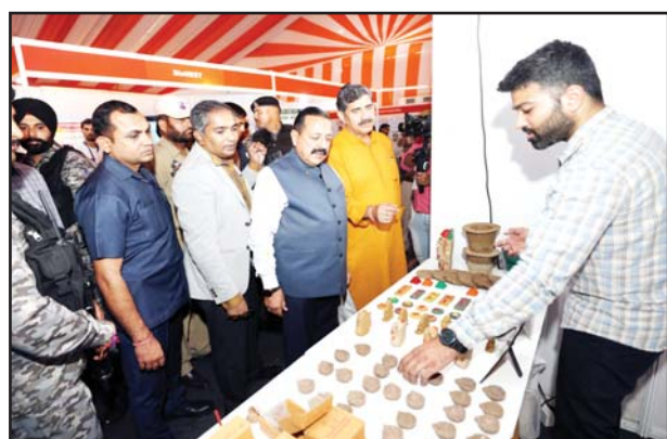
Union Minister Dr Jitendra Singh taking round of stalls after inaugurating the first of its kind Startup Expo at Jammu on Friday.

Inaugurating the first-of-its-kind Startup Expo here, covering areas of Agriculture, Aroma, Dairy, Pharma, IT, Computer and Communications, Dr Jitendra Singh gave full credit to the futur-