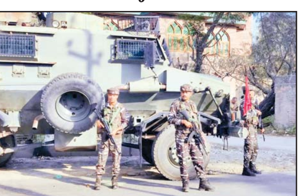
Security personnel near the site of militant attack at Pulwama on Sunday.