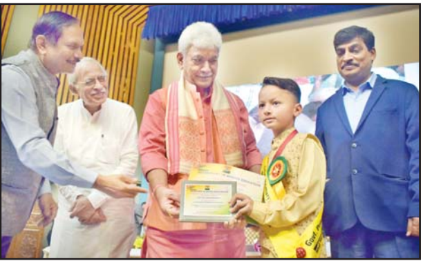
LG Manoj Sinha felicitating a student at SKICC in Srinagar on Sunday.

"Violence has no place in a civilized society. Truth and