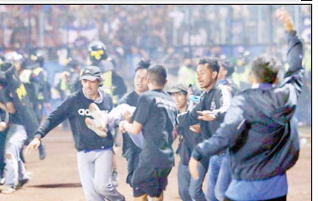
People shift an injured man at the Kanjuruhan Stadium in Malang of East Java province, Indonesia to hospital after stampede.

Disappointed with their team's loss, thousands of supporters of Arema, known as