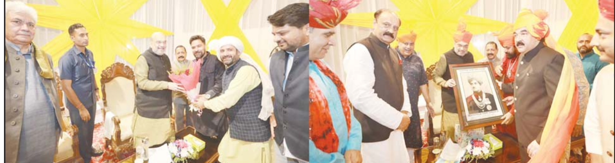
Union Home Minister Amit Shah meeting delegations of Paharis and Dogra Samaj at Raj Bhawan in Jammu on Monday. Another pic on page 2.