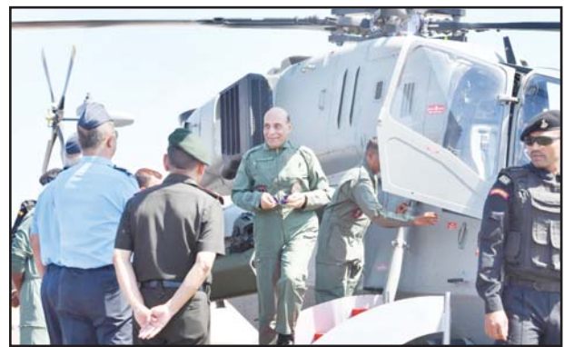
Defence Minister Rajnath Singh along with Chief of Air Staff Air Chief Marshal V R Chaudhary presenting keys of indigenously built Light Combat Aircraft 'Prachand' at the induction ceremony in Jodhpur on Monday.

Developed by State-run aerospace major Hindustan Aeronautics Ltd (HAL), the 5.8-tonne twin-engine gunship chopper is armed with air-to-air mis-