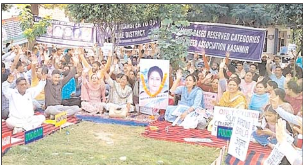
Jammu based reserved category employees staging protest at Ambedkar Chowk, Jammu.