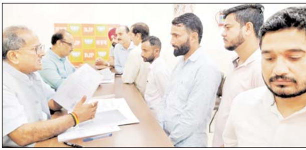
BJP leaders listening public grievances at Jammu on Monday.