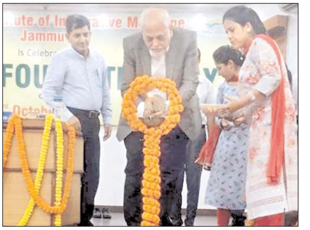
Chief guest lighting ceremonial lamp during CSIR foundation day celebration at Jammu on Monday.

Excelsior Correspondent JAMMU, Oct 3: Reliance Digital has brought the exciting offers for Dusshera. In addition to exciting offers, to make this celebration even more joyous, the customer can avail a 10% instant discount on leading bank cards along with easy EMI options. The customers can choose from the widest range of favourite electronics, right from TVs and domestic appliances, to audio devices, mobile phones, laptops and more. Be it for gifting or your own use, Reliance Digital has best offers lined up this festive season. The Apple Watch is starting at just Rs 17,100 (including bank cashback) and Samsung watch starting at just Rs 6490. Also, favourite smartwatches are starting at only Rs 1599. Samsung Galaxy Book 2 12th Gen i5 with 16GB RAM &