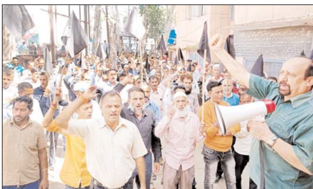
PHE workers staging massive protest at Udhampur on Monday.

Excelsior Correspondent JAMMU, Oct 3: The protest of All Jammu Based Reserve Category Employees' Association for suitable comprehensive transfer policy entered 125th day, here at Ambedkar Chowk. Jammu based reserved category employees have been protesting peacefully for last 125 days to meet their demand of transfer policy. They are following the path of non violence as propounded by Mahatma Gandhi and they bank on LG Administration that their genuine demand will be addressed very soon. On upcoming visit of Home Minister Amit Shah, they expressed optimism that Amit Shah will intervene in the matter of transfer policy of Jammu based reserved category employees working in Kashmir Division and hopefully LG Administration will redress this long pending demand of Dogra