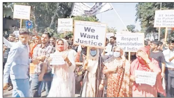
Gujjar-Bakkerwal students protesting at Jammu on Monday.