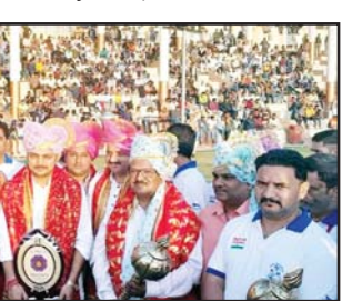
Winners posing for a group photograph along with dignitaries at Katra on Tuesday.