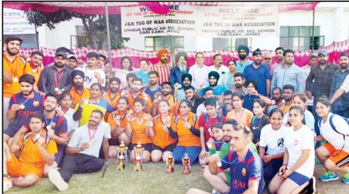
Winners displaying medals and trophies while posing for a group photograph at Jammu on Tuesday.

The certificates and title trophies, medals and certificates were sponsored by Trans Asia Hotel Pvt. Ltd.