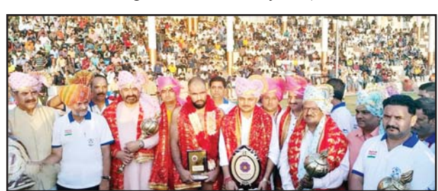
Winners posing for a group photograph along with dignitaries at Katra on Tuesday.

In the 60 minutes match, both the teams were at equal score (3-3) and the match was decided in shootout method, wherein Dashmesh HC emerged winners.