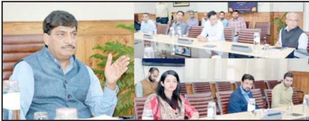
Chief Secretary chairing a meeting.