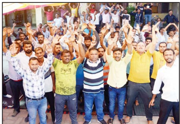
PHE workers staging protest outside Chief Engg's office at BC Road in Jammu on Thursday.

With these observations, the court rejected the bail application.