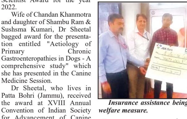
Insurance assistance being provided to SMVDSB staff as a welfare measure.