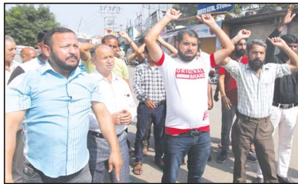
Estate employees protesting on Friday.