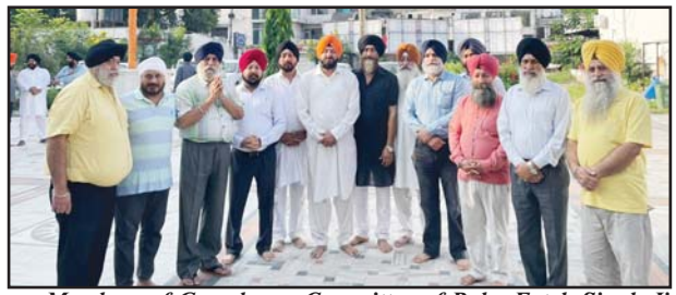
Members of Gurudwara Committee of Baba Fateh Singh Ji pose for a group photograph at Jammu on Friday.