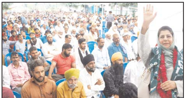
PDP president Mehbooba Mufti waving to party workers during a meeting in Jammu.

said BJP always speaks to Jammu people claiming that they will make a CM from Jammu. " If BJP leaders are so true to their words, commitment and sincere towards people of Jammu, they should have