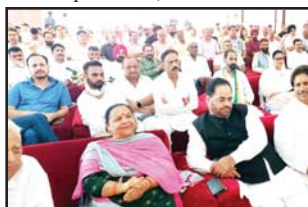
Senior Congress leader, Mallikarjun Kharge addressing party delegates at Jammu on Sunday.

"Congress is the largest democratic party in the country where elections are held right from booth level upwards to the AICC president, if there is a