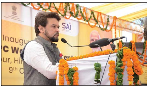
Union Minister of Sports and Youth Affairs Anurag Singh Thakur addressing at the inauguration of a Water Sports Centre in Koldam Baramana, Bilaspur, in Himachal Pradesh on Sunday.

HAMIRPUR (HP), Oct 9: Union Information and Broadcasting Minister Anurag Thakur said Sunday the BJP was ready for elections any time. He said the party was not waiting for the enforcement of