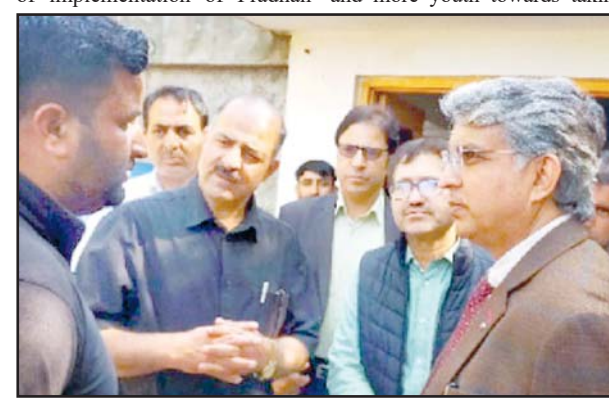
Union Joint Secretary Fisheries interacting with officers during visit to Anantnag.