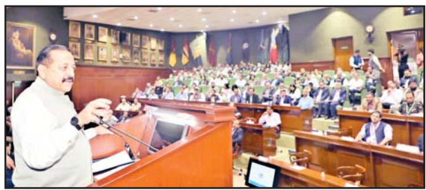
Union Minister Dr Jitendra Singh delivering inaugural address at the "India Space Conclave" commemorating first anniversary of "Indian Space Association" (ISPA), at Manekshaw Centre, New Delhi on Monday.

Dr Jitendra Singh highlighted the constructive role played by ISPA in engaging with the Telecom Regulatory Authority of India, Ministry of Defence and the three services to address their requirements and said that ISPA will play a much deeper role in supporting the capability and capacity-building initiatives of the Government in times to come. The Minister also thanked the Chairman and Director General of ISPA as well as their members for having put up a splendid show by organising this event.