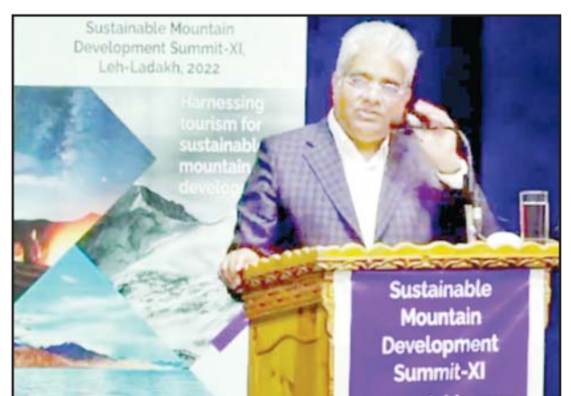
Union Minister for Environment, Forest and Climate Change Bhupender Yadav speaking at the 11th Edition of the Sustainable Mountain Development Summit in Ladakh on Monday.

He expressed that visiting Ladakh is always refreshing due to its beautiful landscape and magnificent mountains. Integration of science and policy is to be the core activity of IMI, in light of this, he suggest-