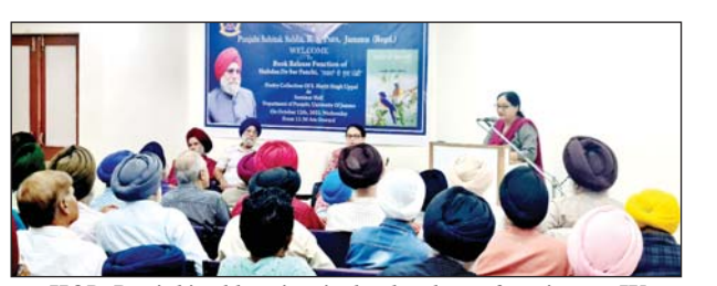
HOD Punjabi addressing in book release function at JU on Wednesday.