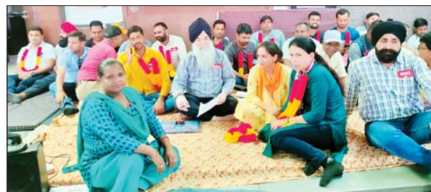
Railway employees sitting on hunger-strike at Railway Station, Jammu.

Excelsior Correspondent the aegis of the Northern Railwaymen's Union in Jammu as well in support of their demands including restoration of old pension scheme, prohibition of privatization and corporatization, filling of vacant posts, completion of cadre restructuring.