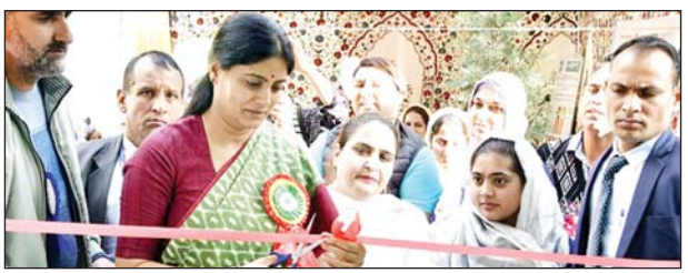
Union MoS Anupriya Singh Patel inaugurating public outreach programme in Ganderbal on Wednesday.

Excelsior Correspondent and other issues for increasing its scope. The Minister while replying to the issues said that the purpose of visiting the Industrial Estate was to take first hand appraisal about its functioning adding that