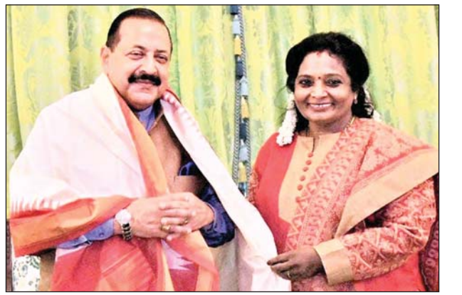
Union Minister Dr Jitendra Singh being greeted by Governor Telangana and LG Puducherry, Dr Tamilai Soundararajan when he called on her at Raj Bhavan, Hyderabad.

three CSIR labs - National Botanical Research Institute (NBRI), Central Drug Research Institute (CDRI) and Central Institute of Medicinal and Aromatic Plants (CIMAP) intro-