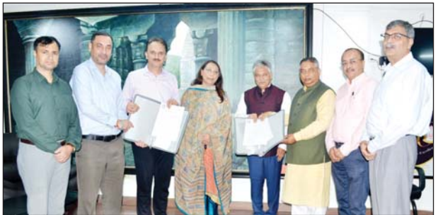
Copies of MoU being displayed after signing by JU & LJK Economic Growth & Development Dialogue.

Later, she also distributed mobility aids among the beneficiaries.