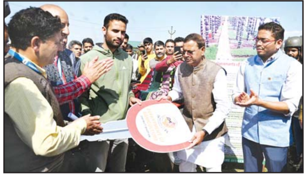
Union MoS Finance, Pankaj Chaudhary handing over key of vehicle to a beneficiary of Govt scheme in Shopian.

SHOPIAN, Oct 13: Union Minister of State for Finance Pankaj Chaudhary today visited district Shopian under third phase of the Public Outreach Programme in order to assess the ground level development