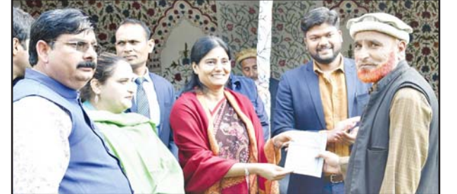
Union MoS for Commerce and Industries handing over financial assistance to a beneficiary in Ganderbal

this year around 1.62 crore tourists have visited J&K adding that nominating Mammer as a tourist village will also increase the tourist footfall in the areas which will generate employment