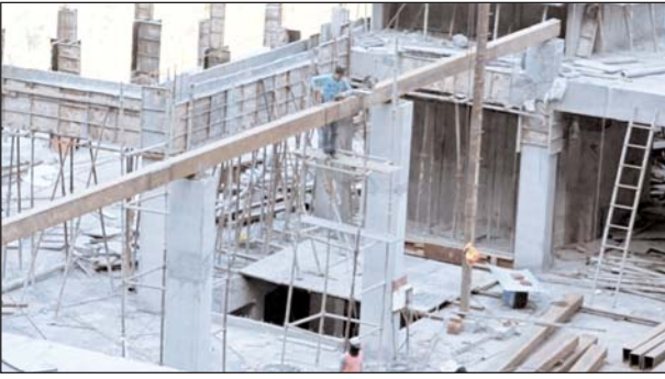
An under construction facility at Mata Vaishno Devi Ji Bhawan.

"With the aim to provide better facilities to pilgrims visiting Shri Mata Vaishno Devi Ji