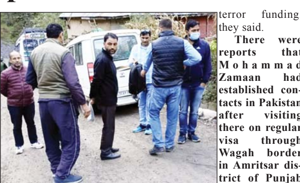
The NIA team near the house of suspect in Mandi, Poonch on Friday.