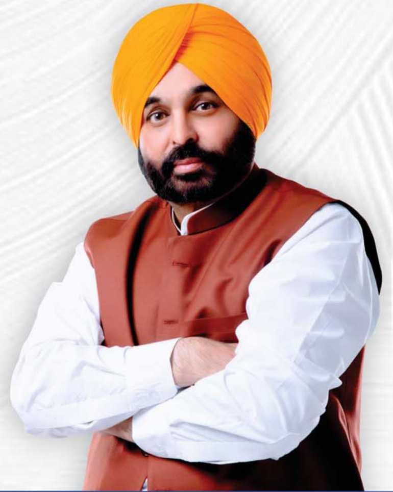
Bhagwant Mann Chief Minister, Punjab