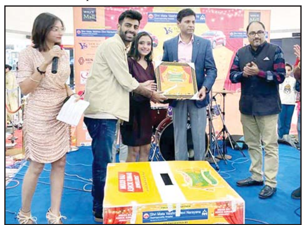
ADGP presenting award to a winner of the 'Mirchi Shopping Carnival' at Jammu on Thursday.