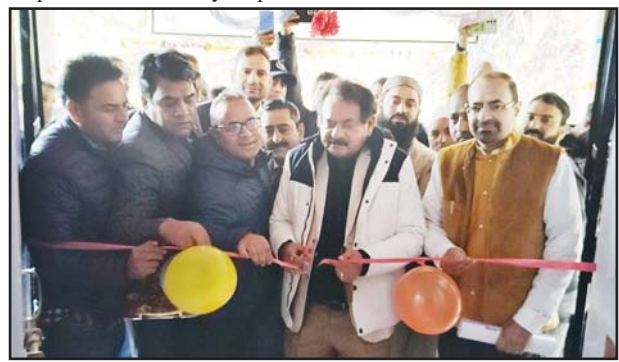
Union MoS for Law & Justice Prof SP Singh Baghel inaugurating PHC at Gugloosa, Trehgam on Thursday.

KUPWARA, Oct 20: Union Minister of State for Law and Justice Prof. S.P Singh Baghel on the second day of his tour to Kupwara district today inspect-