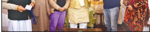
Delegation of Cultural and Folks Artists during meeting with LG.

While reviewing the activities under the ongoing Jan Abhiyan launched by the Government from October 15 to October 26, the Div Com laid stress on full saturation of department wise deliverables within the mandated timeline. He stressed on active involvement of PRIs, prominent citizens in Jan Abhiyan and also stressed on IEC campaigns on