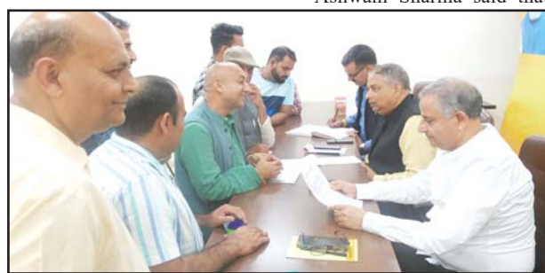
BJP leaders listening public grievances at BJP headquarters.