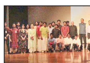
Participants of student exchange program from Tamil Nadu posing for a group photograph during valedictory function at SMVDU.

While admitting these leaders in the party fold, Ch.Lal Singh said that our party is expanding all across the region and people are enthusiastic to join to see the demand of separate Jammu State with Article 371 is accomplished. DSSP has geared up and is in action to see its activities reach in every nook and corner of Jammu