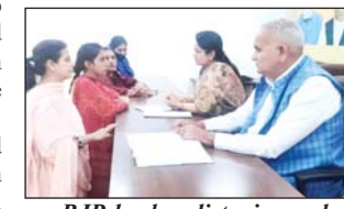
BJP leaders listening public grievances at Jammu on Friday.

their woes and problems. The issues presented by common masses before the senior party leaders were related to PHE, PWD, Rural Development,