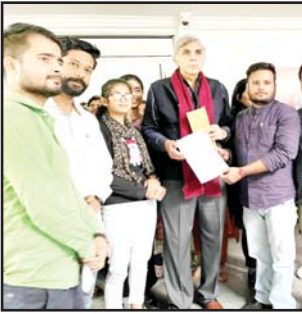
ABVP delegation submitting a memorandum to Vice-Chairman of Higher Education Council at Jammu.