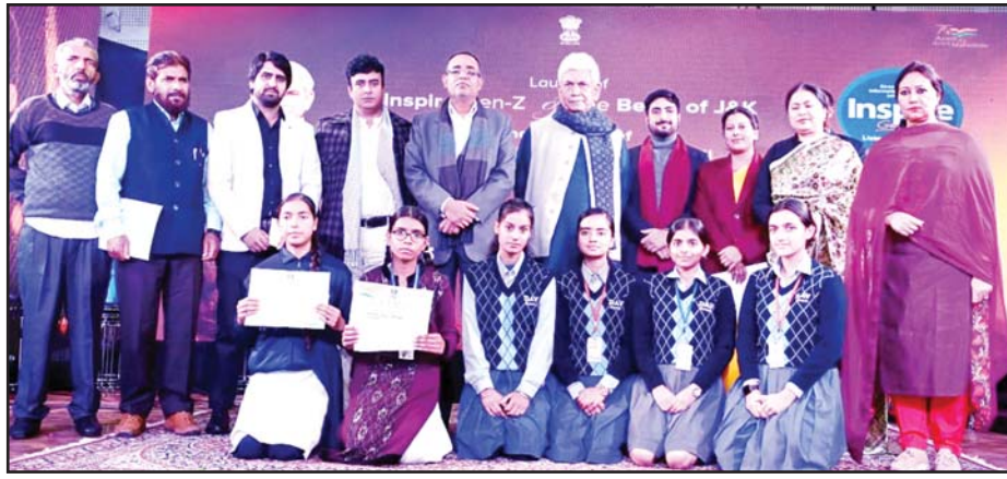
Lt Governor Manoj Sinha felicitating the winners of National Anthem Round-2.

From communicating Government programmes and policies to the public to disseminating cultural tradition, the Information Department is playing an important