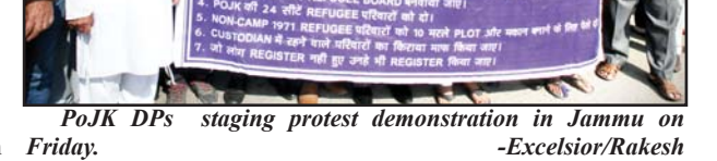
PoJK DPs staging protest demonstration in Jammu on Friday.