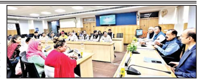
Union Minister Dr Jitendra Singh interacting with Corporators of Srinagar Municipal Corporation at IIPA, New Delhi on Friday.