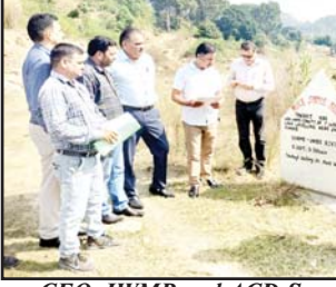
CEO, IWMP and ACD Sunderbani inspecting an executed work at border village Nah in IWMP inspected works in