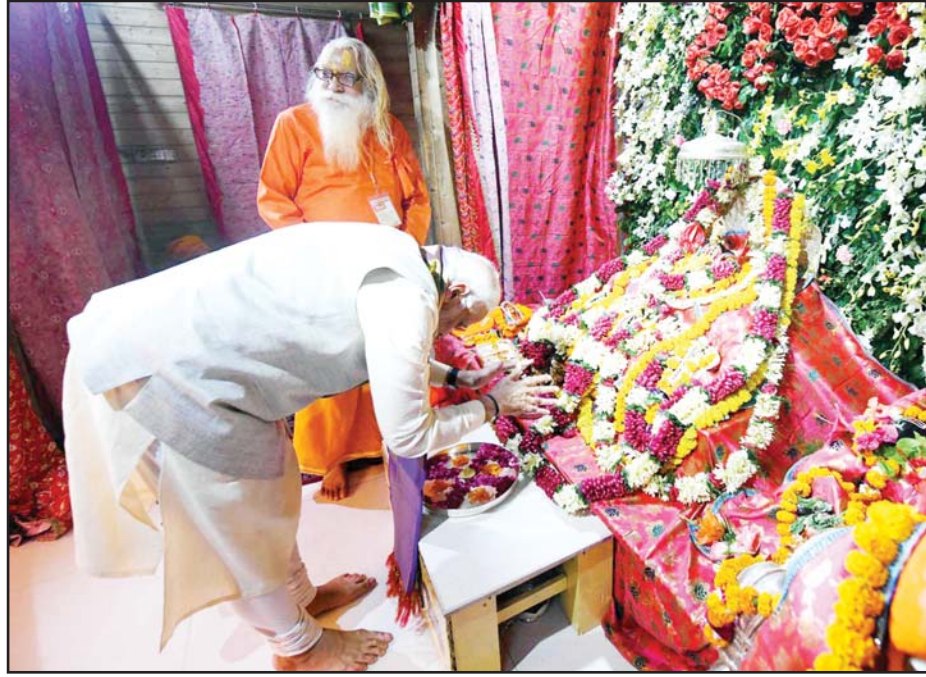
Prime Minister Narendra Modi performs Darshan and Pooja of Bhagwan Shree Ramlala Virajman, in Ayodhya on Sunday.