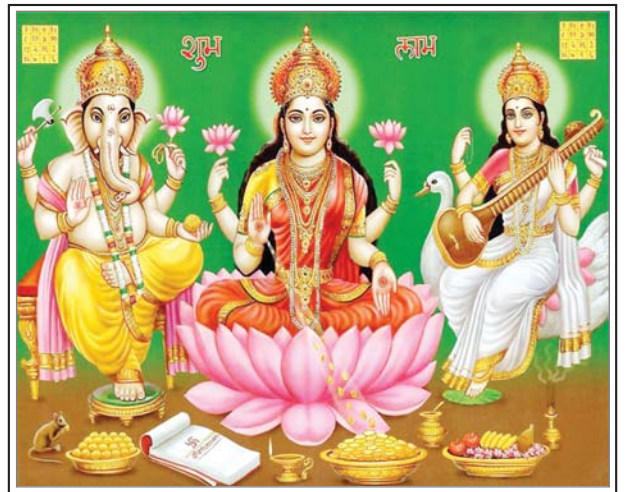
Excelsior Extends Diwali Greetings To All Its Readers. Offices of Daily Excelsior and Excelsior Printers Pvt Ltd will remain closed on Monday (October 24). Therefore, there will be no issue of your newspaper on Tuesday (October 25). -Editor