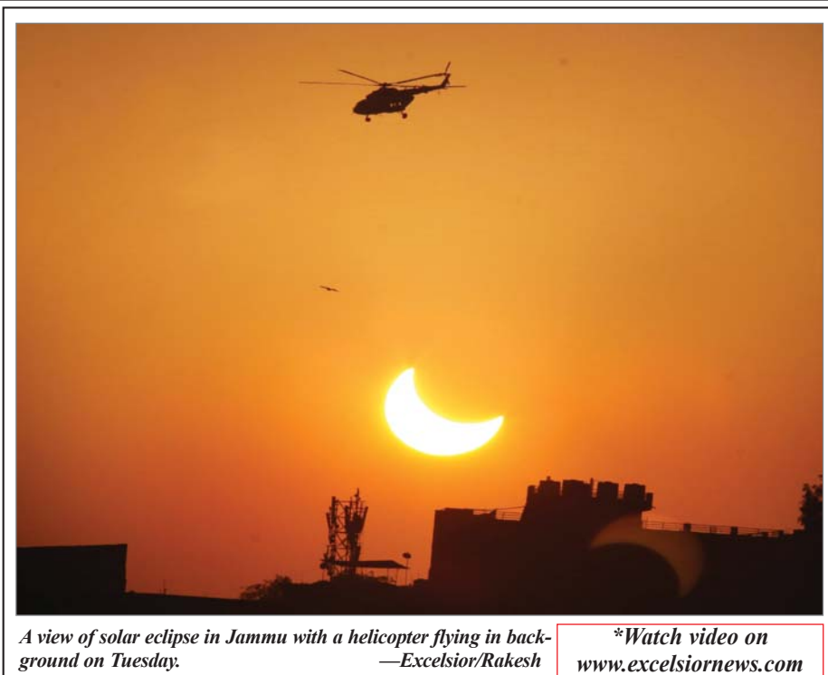
A view of solar eclipse in Jammu with a helicopter flying in background on Tuesday.