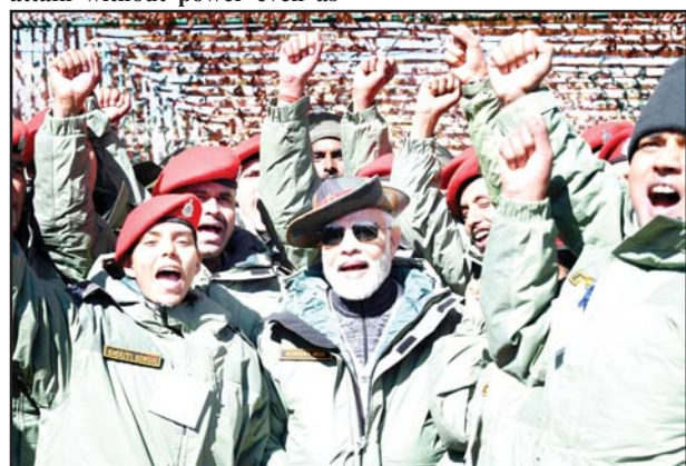
Prime Minister Narendra Modi with soldiers in Kargil on the occasion of Diwali.

Addressing jawans as the "family", the Prime Minister said he couldn't have celebrated