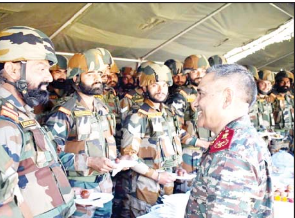
Chief of Defence Staff Gen Anil Chauhan visits forward posts in Rajouri sector. Another pic on page 6.

The Field Commanders in the Rajouri sector briefed the CDS on the security situation along the LoC, the Army said in a statement.