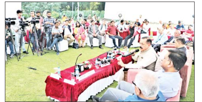
Union Minister Dr Jitendra Singh holding a media interaction over Diwali high-tea at his New Delhi residence on Tuesday.