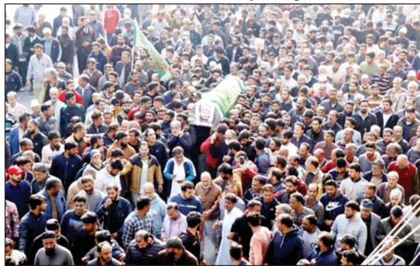
People carry body of veteran Kashmiri separatist leader Maulvi Abbas Ansari during funeral procession in Srinagar.

preacher and reformer, headed the separatist conglomerate when the Hurriyat engaged with the Centre for talks—under his leadership, the Hurriyat delegation for the first time