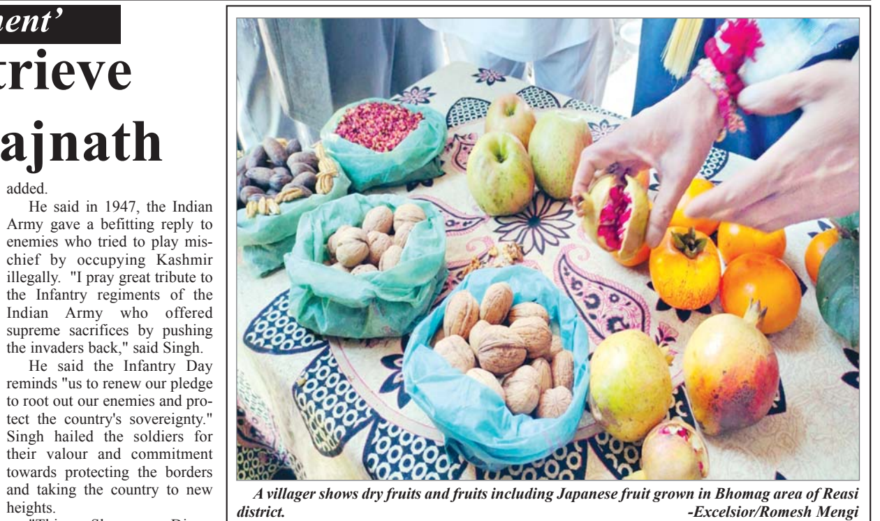
A villager shows dry fruits and fruits including Japanese fruit grown in Bhomag area of Reasi district.