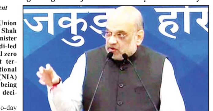
Union Home Minister Amit Shah addressing 'Chintan Shivir' at Surajkund in Haryana on Thursday.

Sixty-four per cent less deaths have been reported and civilian deaths in terror incidents have gone down by 90 per cent during the period," the Home Minister said.