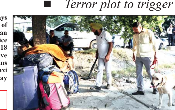
Dog squad at the site of recovery of explosives near Railway Station in Jammu on Thursday.

A police team rushed to the spot and took possession of the bag. It contained 18 detonators, some wires and around 500 grams wax-type material packed