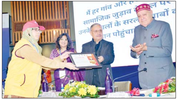
Union MoS Rao Inderjit Singh inaugurating Investors, Education, Awareness & Protection Conference in Srinagar on Friday.