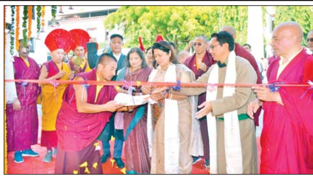
Union Minister Meenakshi Lekhi, flanked by Ladakh MP inaugurating DKD Gonpa School in Dehradun.

A case under relevant sections has been registered at Police Station Nagrota and investigation started.