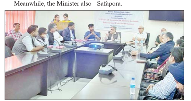
Prof Naresh Padha & others participating in seminar by JKSC on Friday.

Union Minister of AYUSH, Ports, Shipping & Waterways, Sarbananda Sonowal posing with students at Ganderbal on Friday. house hold name in all corners of the UT. AYUSH Health & Wellness Centers have been established and Yoga instructors have been engaged in all AYUSH Health & Wellness Centers for promotion of health and prevention of diseases through Yoga Asanas, he added. The Government Unani Medical College and Hospital Ganderbal was granted permission by Central Government to start the First Batch of Bachelors in Unani Medicine and Surgery (BUMS) course from the academic session of 2020-21 with an intake capacity of 60 seats, he informed.