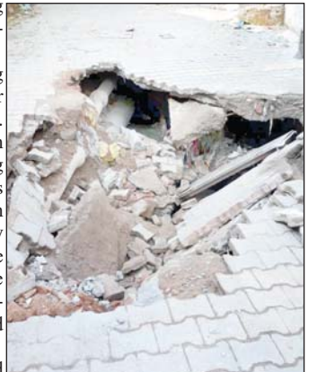
A lane caves in near Dakki Pir Kho in Jammu.

He will take up matters related to the State Cancer Institute at Jammu.