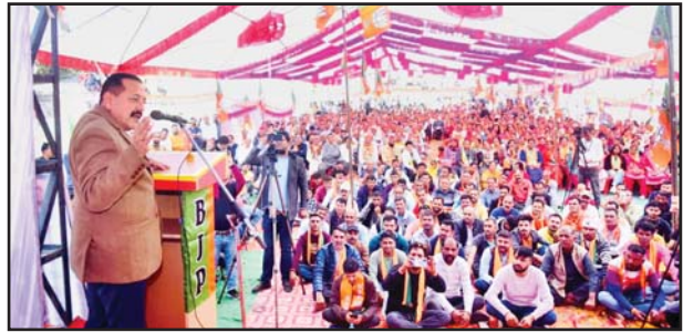
Union Minister Dr Jitendra Singh addressing a series of BJP public rallies in Sunder Nagar, Bahl and Nachan Assembly segments of Himachal Pradesh on Sunday.

ous income shown by him. The I-T probe in 2015 found that the sale of apples from Singh's Shrikhand orchard in Shimla district could not have fetched him more than Rs 64 lakh as against Rs 1.55 crore he showed in 2011.