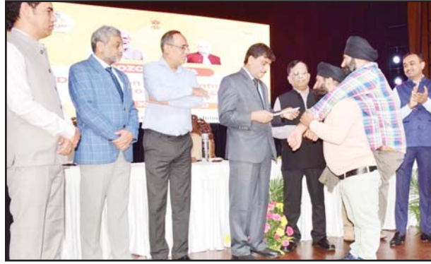
Chief Secretary distributing appointment letters.