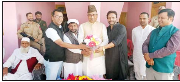
MP (Rajya Sabha), Gulam Ali Khatana being presented a bouquet by members of Pasmada Samaj at a function held at Duggiya -Bhatindi on Sunday.

JAMMU, Oct 30: Er. Gulam Ali Khatana, MP Rajya Sabha today stressed that Bharatiya Janata Party (BJP) is the only hope for the Pasmada Samaj and