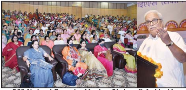
RSS National Executive Member, Bhaiyya Ji Joshi addressing a function at Jammu.

JAMMU, Sept 23: RSS National Executive member and senior leader, Bhaiyya Ji Joshi, said women have taken lead in many unfamiliar fields and this growth and taking up