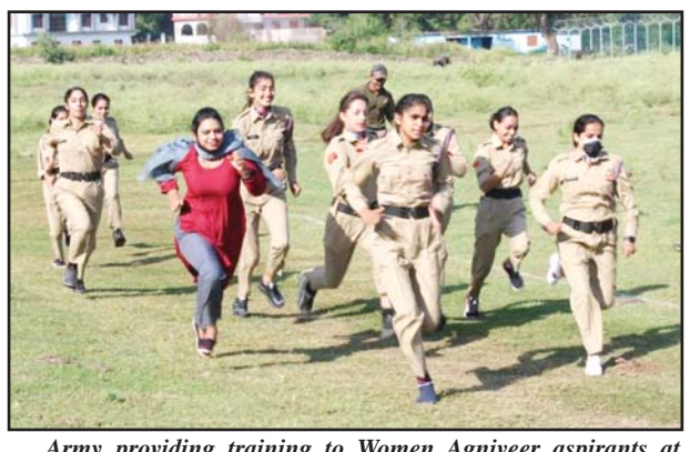
Army providing training to Women Agniveer aspirants at Mendhar in district Poonch.

At the outset of the meeting, Retired Police Welfare Forum appreciated Samba police for organizing the meeting to enquire about their well beings and to let them know about the welfare