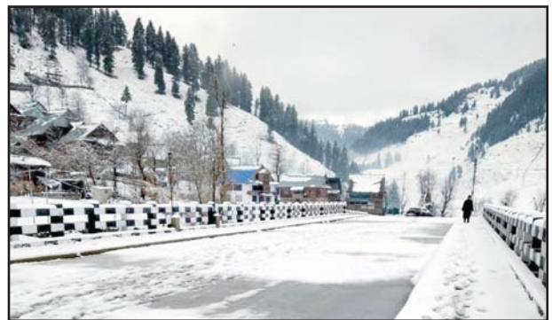
Machil, the border town in Kupwara district, receives fresh snowfall on Tuesday.

The snowfall has led to accumulation of snow on Bandipora-Gurez road. Authorities today rescued 53 vehicles, along with their drivers and passengers, who were trapped in the snow at Razdan Top on the Bandipora-Gurez road.