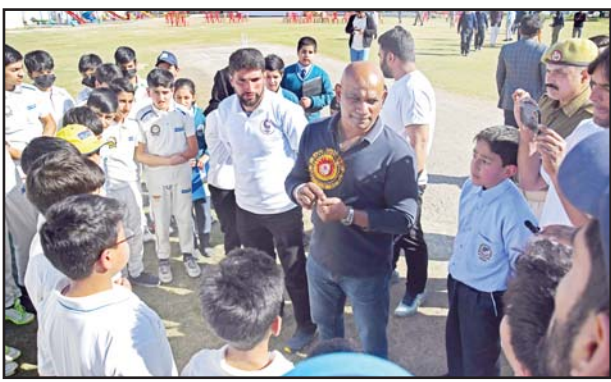
Former Sri Lankan cricketer Sanath Jayasuriya interacting with young players at Srinagar on Saturday.

"There was a hard patch for my nation. The demonstrations continued for a while. People today seek a future. There aren't any problems right now. We want Sri Lanka to be depicted favourably in the media and that you must do," he added.