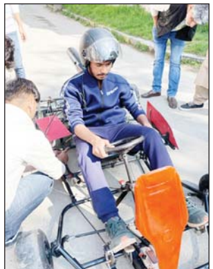
NIT Srinagar developed Go-Kart during a trial run.

SRINAGAR, Apr 8: A group of 25 students from National Institute of Technology (NIT)