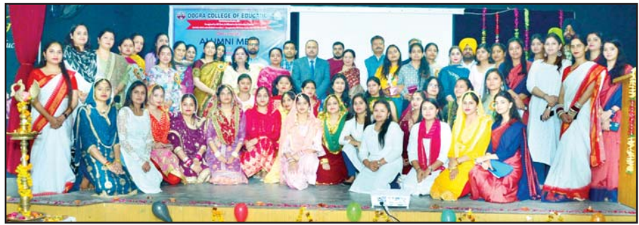
Alumni of Dogra College of Education and others pose for a group photograph during a meet on Saturday.