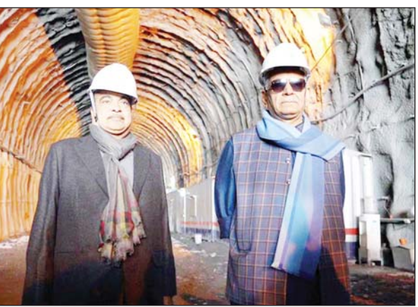
Union Minister of Road Transport and Highways Nitin Gadkari and Lt Governor Manoj Sinha at Zojila Tunnel to inspect the ongoing work on Monday.

"Presently the distance from Delhi to Katra is 727 kms, this expressway will reduce the distance by 58 kms. With this, there is a possibility that the distance between Delhi-Amritsar, Delhi-Katra, and Delhi-Srinagar will