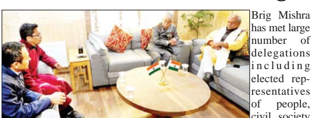
Union Agriculture and Farmers Welfare Minister N S Tomar with LG Ladakh Brig (Retd) B D Mishra in Leh on Monday.

"I'm happy to be in Ladakh. Corruption free Ladakh is my target. When corruption and delay in execution of works end, development will happen," Mishra said, adding development has no meaning till it reaches last house in last village.