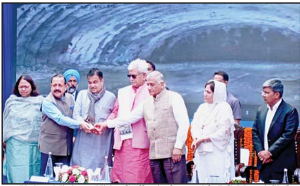
Union Minister Nitin Gadkari along with LG Manoj Sinha, Dr Jitendra Singh and V K Singh conducting breakthrough of a tunnel on Tuesday.