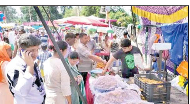
People making purchases from various stalls at Canal road during Baisakhi festival on Friday. Another pic on page 4.

JAMMU/SRINAGAR, Apr 14: Baisakhi, marking the beginning of the New Year, birth of Khalsa Panth and signifying beginning of harvesting season was celebrated with religious fervour and gaiety across Jammu and Kashmir today. The day also signifies beginning of Spring season. In connection with Baisakhi celebration, colourful and glittering functions were held at various places across Jammu region in which thousands of people participated. A three-day Baisakhi festival is underway at Mubarak Mandi here which started yester-