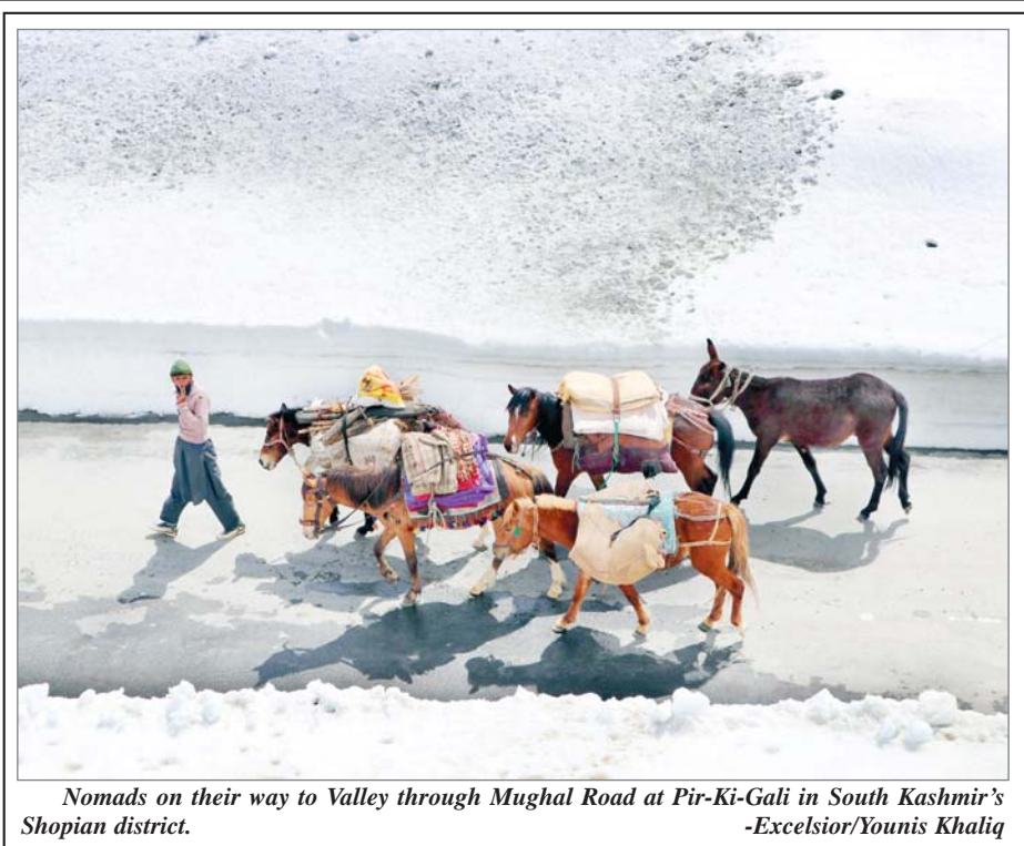
Nomads on their way to Valley through Mughal Road at Pir-Ki-Gali in South Kashmir's Shopian district.

The CBI today summoned Delhi Chief Minister Arvind Kejriwal on April 16 in connection with the excise policy scam case, in which his former Deputy Manish Sisodia was arrested last month. According to the notice issued by the CBI, Kejriwal has been called to appear at the agency headquarters at 11 am on Sunday to answer queries of the investigating team as a witness in the case, officials said. The Aam Aadmi Party (AAP) called it a conspiracy and confirmed that Kejriwal will appear before the agency on Sunday. There are allegations that money raised from tweaking the policy in favour of certain liquor dealers and the South lobby was suspected to be pumped in for election purposes by the AAP, which is under the probe as part of the money trail, agency sources said. They said the process of policy formulation and influence of South lobby, besides changes in the draft stages, was in the know of the Chief Minister, which makes it necessary to put questions to him. (Contd on page 4 Col 1)