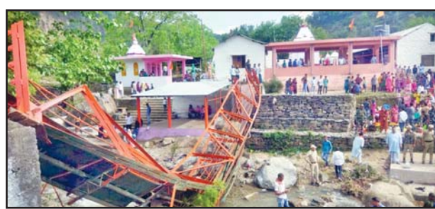
Collapsed footbridge at Beni Sangam in Chenani.