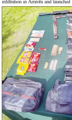
Recoveries made from slain intruder in Kupwara.

"Indian Army along with other security agencies are determined to defeat the nefarious design of the adversaries and are always combat ready to ensure safety and security of citizens in Kashmir", it added.