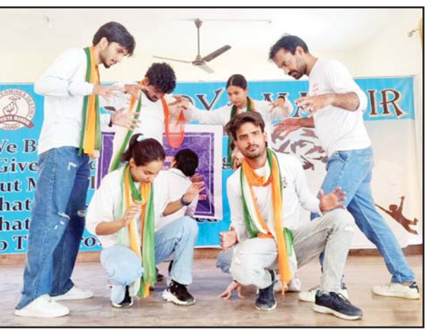
Artists of HDCS staging Nukkad Natak in Jammu.