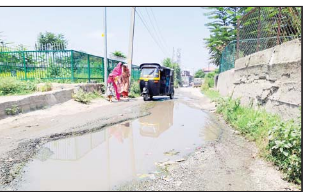
View of a dilapidated road near Islamia College leading to Makhdoom Sahib's Shrine in Srinagar on Wednesday.