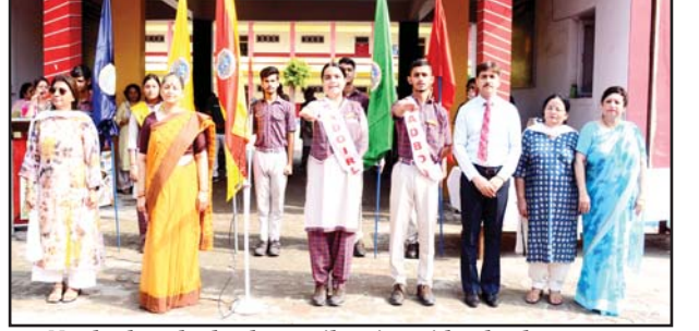
Newly elected school council posing with school management.