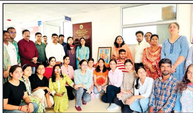
Participants at Bharat Mata Pujan event in CUJ.