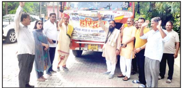
Dignitaries flagging off pilgrims to Haridwar from Jammu on Thursday.

Forest Act. "After Parliament passed the dangerous amendments to the Forest Conservation Act, 1980 last week, which many, including me, had warned against, the Odisha Government was quick to pass orders that 'deemed' forests would no longer be considered as forests," Ramesh said. "Now the Union Ministry says the state's order is withdrawn. Confusion galore. In its hurry to do away with 'deemed' forests, the Modi Government has actually doomed forests," he said in his post on X. "Deemed forests' are forests that are not classified so, by the Centre or states, in their records. (PTI)